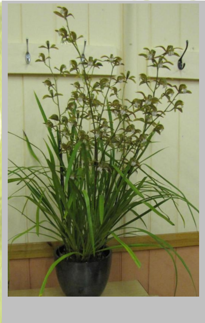
• Cymbidium Erythraeum