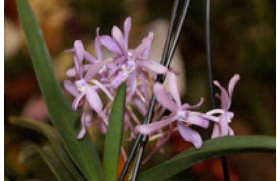
Rhy. coelestis x neo. Falcata