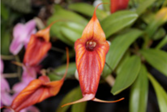
Masdevallia Prince Charming