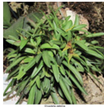
1st Tony Nappin

Photographs of the Societies displays plus the 1st place winning orchids