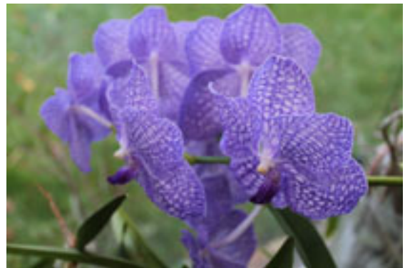
Vanda Blue Magic