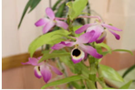
Dendrobium Mervyn H