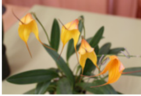
Masdevallia Orange Hybrid